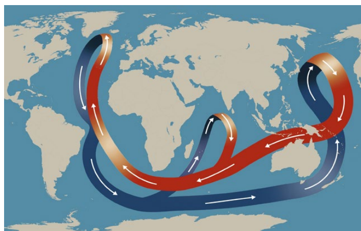
Thermohaline circulation (THC), Conveyor belt

In 2011 the Catlin Arctic Survey was commissioned by The Catlin Group to assess the temporary ice base on the Prince Gustav Adolf Sea, on the northernmost fringe of Canada's Arctic archipelago, around 800 miles from the North Pole.