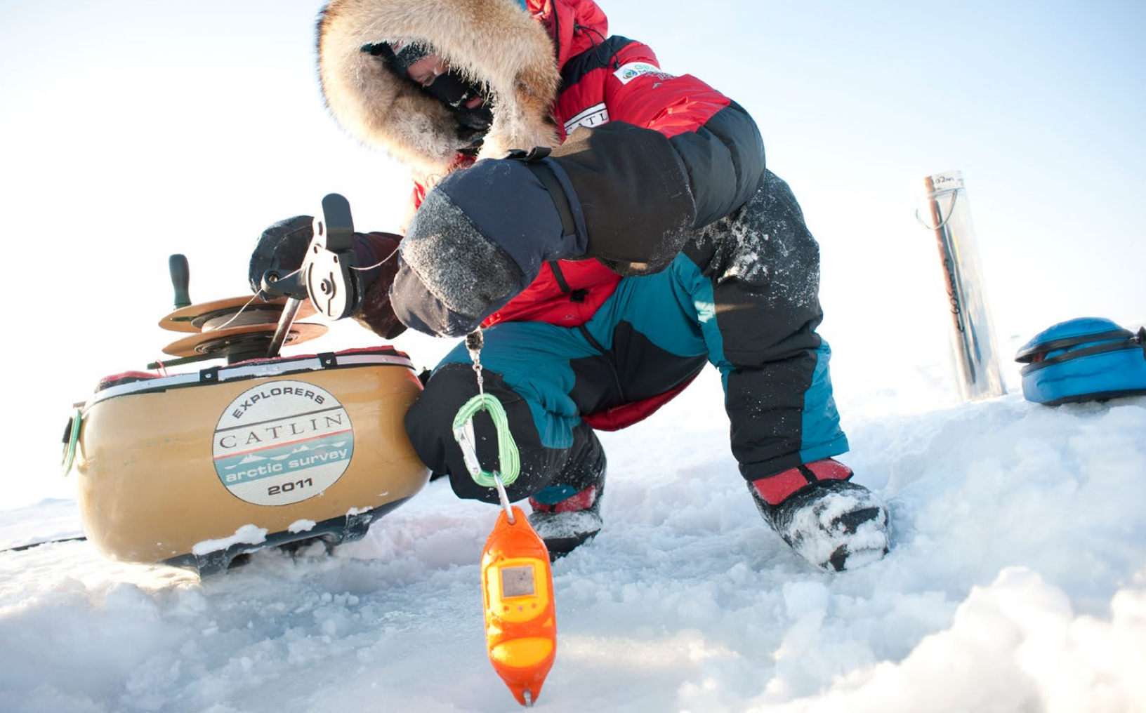
Researchers from the Catlin Survey team deploy a lightweight CTD under Arctic ice to trace effects of melting ice and warmer temperatures.