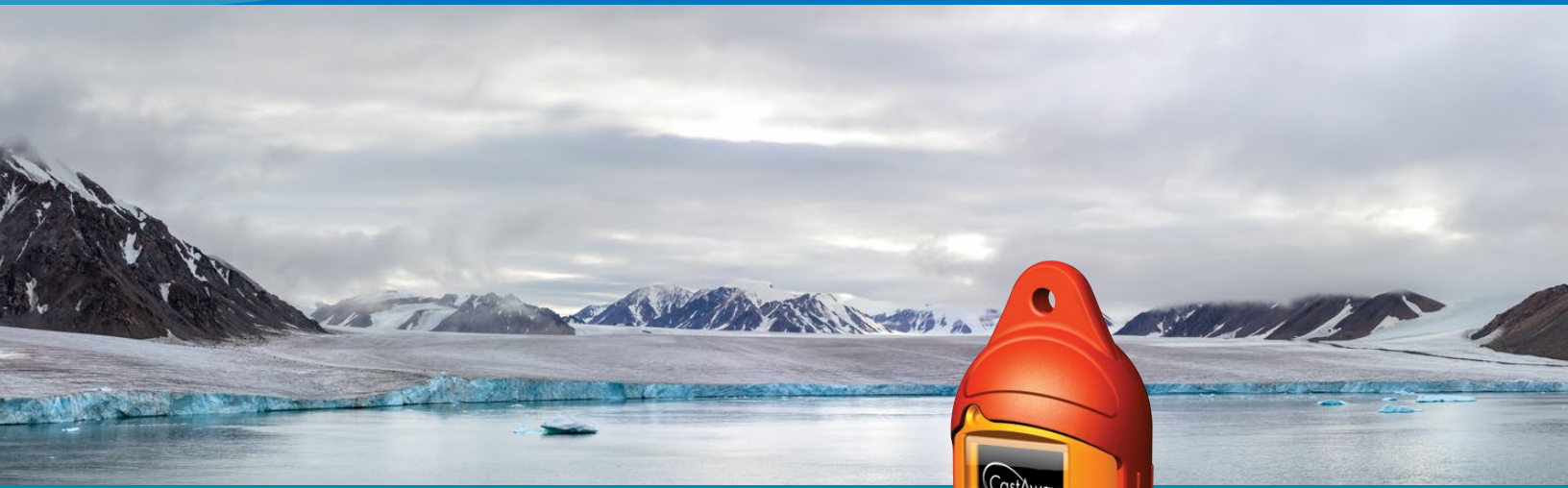
Panorama of a glacier and mountains in Ellesmere Island, part of the Qikiqtaaluk Region in the Canadian territory of Nunavut.

ARCTIC SECRETS REVEALED ON THE FRINGE OF CANADA'S ARCTIC ARCHIPELAGO