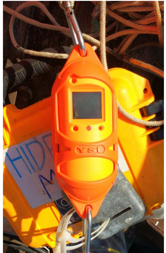
The SonTek CastAway-CTD measures conductivity, temperature, and depth.

Incorporating GPS, sensors, data logging and a display into one compact instrument, the device is literally cast (or lowered) into water and retrieved immediately.